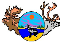
Black Lake First Nation