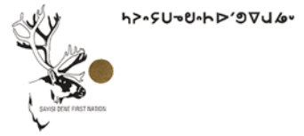
Sayisi Dene First Nation