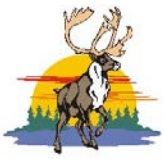
Hatchet Lake First Nation