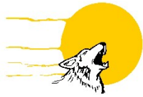
Fond du Lac First Nation