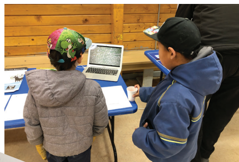
Top to bottom, L to R: