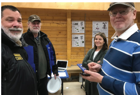
Top to bottom, L to R: