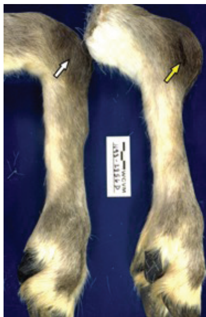
Normal caribou knee (l) compared to caribou infected with brucellosis (r).

Tapeworms: Usually seen as cysts in the liver, lung, or muscles. You will see a small clear cyst with a central white spot or white scar in the liver, a cyst with a thick wall in the lung, or small white to yellow lumps throughout the meat. Cysts should be cut out and meat thoroughly cooked if cysts are noticed. It is dangerous to feed undercooked infected organs or meat to dogs, as they will become infected and pass the eggs in their feces. These eggs are dangerous to people as we can accidentally ingest them and develop similar cysts to those seen in the caribou. If you suspect a caribou is infected, only feed well cooked organs or meat from that caribou to your dog.